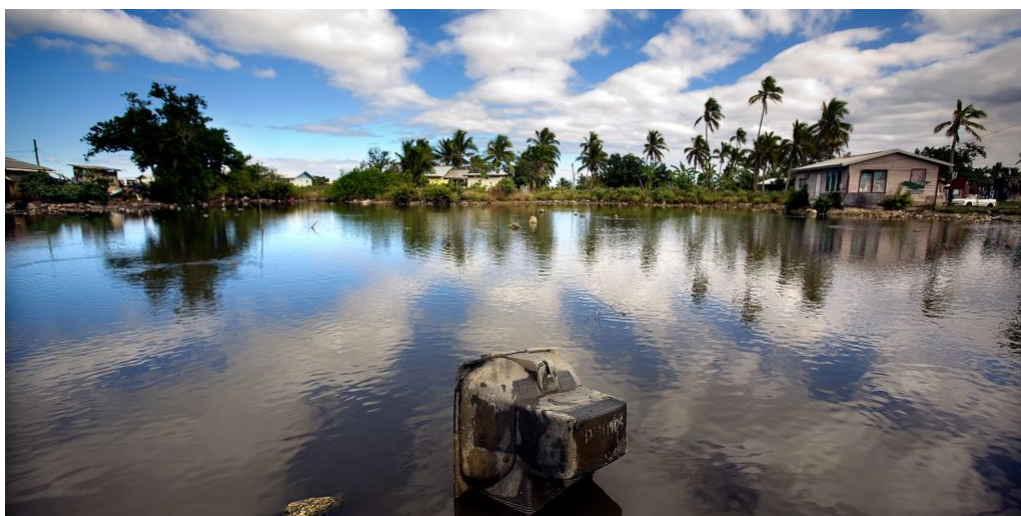
Pacific island countries need to include climate action in national development plans to lessen the economic costs of climate change.