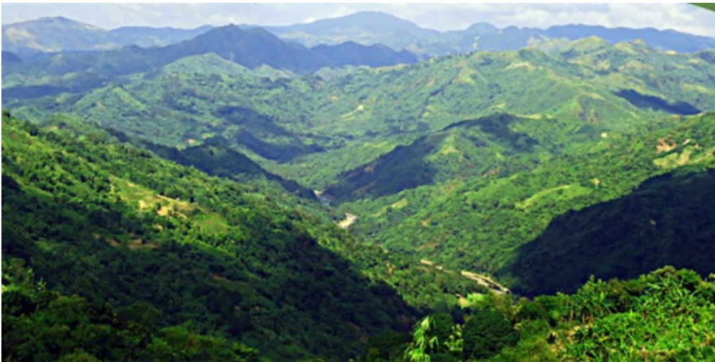
At-risk municipalities in the Philippines take the green growth path by building climate change-resilient ecotowns.