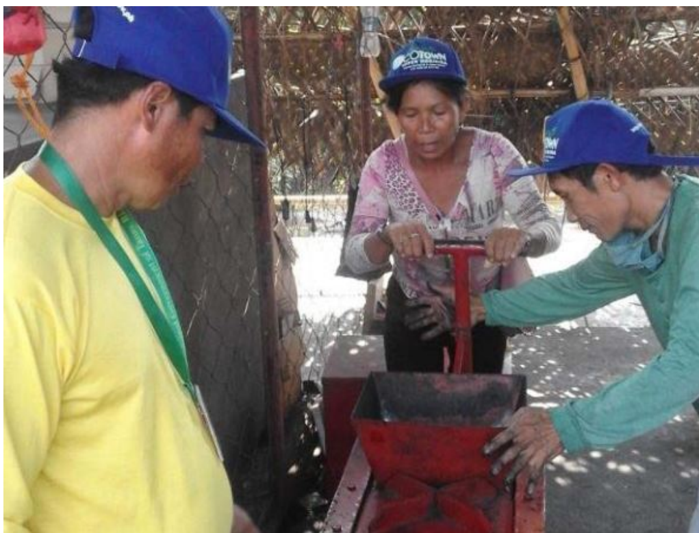
Communities were trained to make charcoal from biowaste. This will help prevent the cutting of trees, which are used in traditional charcoal production.