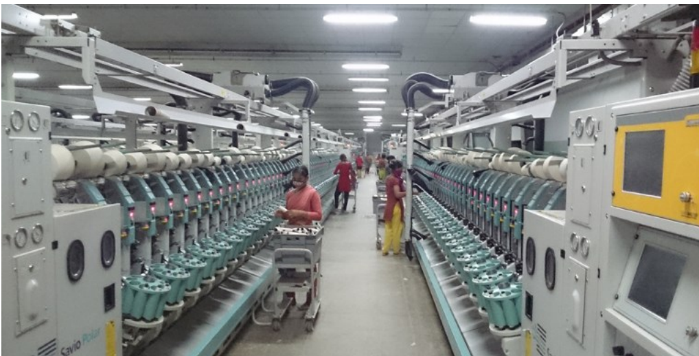
SEIP seeks to increase women's participation in TVET.

In order to encourage participation, SEIP has reserved 30% of the training spots for women while 15% is allocated for disadvantaged and physically challenged groups.