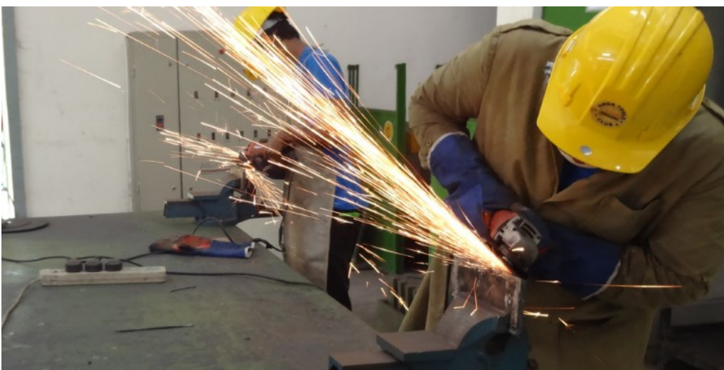
Bangladesh trained 1.5 million people by linking directly to the real-world needs of employers.